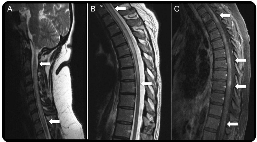
Longitudinally extensive transverse myelitis of the cervical (A) and cervicothoracic (B) region (T2-weighted images) with non-homogeneous gadolinium enhancement in multiple levels of the spinal cord (C) (T1-weighted image with gadolinium injection) in aquaporin-4 immunoglobulin G-seropositive patients.

immunoreactivity was also demonstrated in breast carcinoma, intestinal carcinoid, and ovarian teratoma tissues from patients with and without NMOSD. 39–41